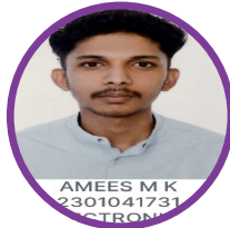
AMEES M K EL