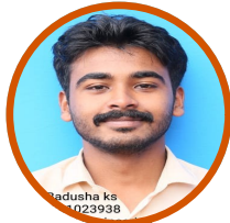
Badusha ks 1023938